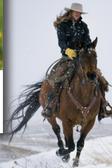
HORSEBACK IN A WINTER WONDERLAND

A generous portion of the 2025 Horse Sense Calendar proceeds is donated to The Foundation for the Horse