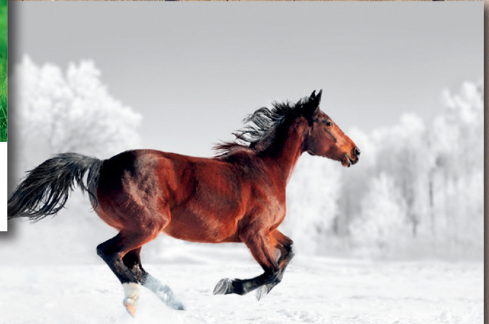
A CHILLY TROT

The back cover features a chart which is useful for recording important health dates.